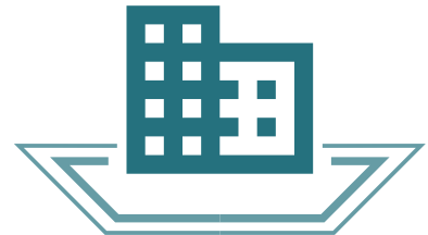
Venue Replay Political Events

With the patented IP Targeting algorithm, that address found in your voter database is now paired with an IP address, creating a way to send digital banner and video advertisements directly into that voters home.