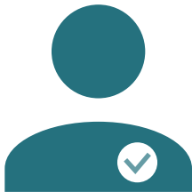
Get Out The Vote (GOTV)

This patented technology has been used in over 2000 political campaigns.